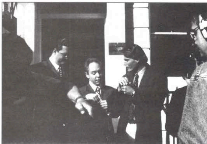
Penn & Teller teach Christopher Reeve the National (U.S.) Magic Trick.

He worked out very well, being a fine actor and, perhaps more importantly, having a good sense of humor. In