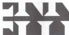
THE HAY-ROOB: THE FULL STORY IN THE NEXT MOFO KNOWS

Our unpleasant world will have six episodes, to appear on national tv in Britain. Each episode will have 24 minutes of performance, mostly in a studio, but also in and about London. The studio will be set as the ruins of a large warehouse/loft, with the Hay-Roob, an emblem we have started to use often, blasted out of the back wall of the set.